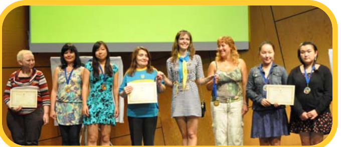
Rapid Teams Women: 1. Russia, 2.The Netherlands (left), 3. Ukraine (right)