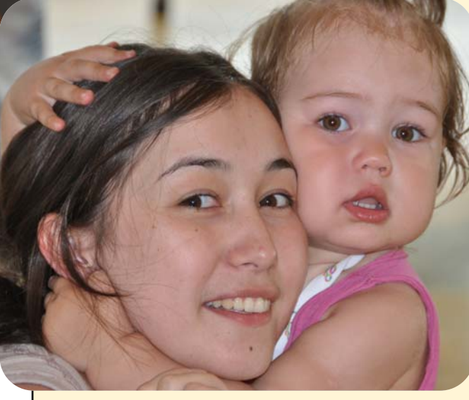
What kind of food makes you happy? Steaks.

Before that, she studied physical culture at University in Bashkiria's capital, Ufa.